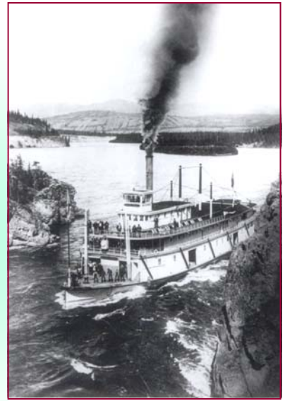
S.S. Klondike National Historic Site, Whitehorse

The S.S. Klondike and the S.S. Keno tell a unique Yukon story about a time when there were no roads and the only way to move large amounts of freight and equipment was by river. The story of these great vessels and the people who worked on them is a Yukon legend.