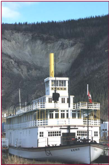
S.S. Keno National Historic Site, Dawson City